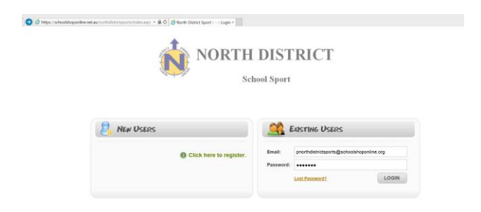
Step 2 - Log in or register as a new user.

https://schoolshoponline.net.au/northdistrictsports/index.aspx