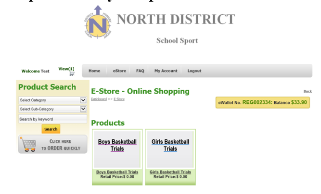
Step 6 – Select your child from the drop down menu then click add to cart.