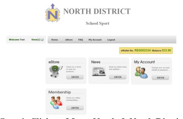
Step 4- Click on Metro North & North District Sports Levy 2016